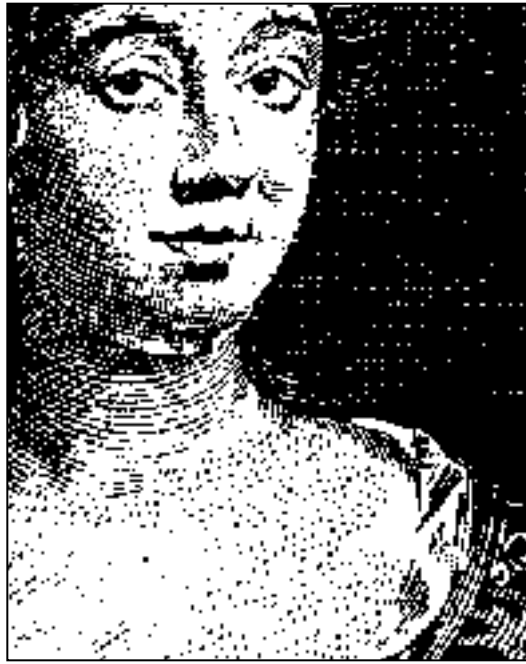
Aphra Behn, Restoration Playwright.

In addition to finding works that I was expecting to find, and finding them much more quickly than previously possible, I also found references to these actors and their roles that I would never have found otherwise. For example, by entering Mohun's name I discovered a reference to him and another actor I was researching in a preface affixed to a play published in 1698, the purpose of which was to make a point about how even good actors cannot "prop" up a poor play text. There are only a small number of